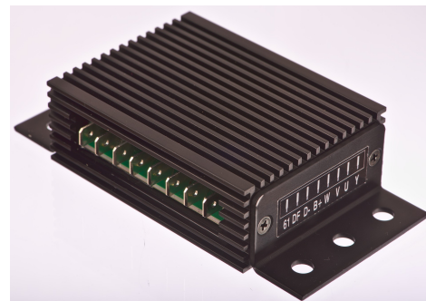
Figure 2 Connections of the REG8-P.

The charge control light is not optional for this regulator. The regulator utilises the charge control light current to generate a magnetic field in the field winding. If no charge control light is used, a 68\ \Omega , 5 W resistor can be used instead. Also if a LED is used instead of a traditional bulb, the current is